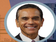
Antonio Villaraigosa Infrastructure Advisor, Former Mayor of Los Angeles