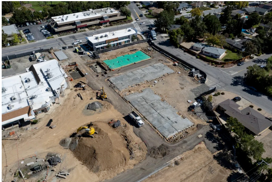
Construction crews work at the Quito Village Development Project in Saratoga on Apr. 13, 2023.

But it's not clear that the company is even following the rule.